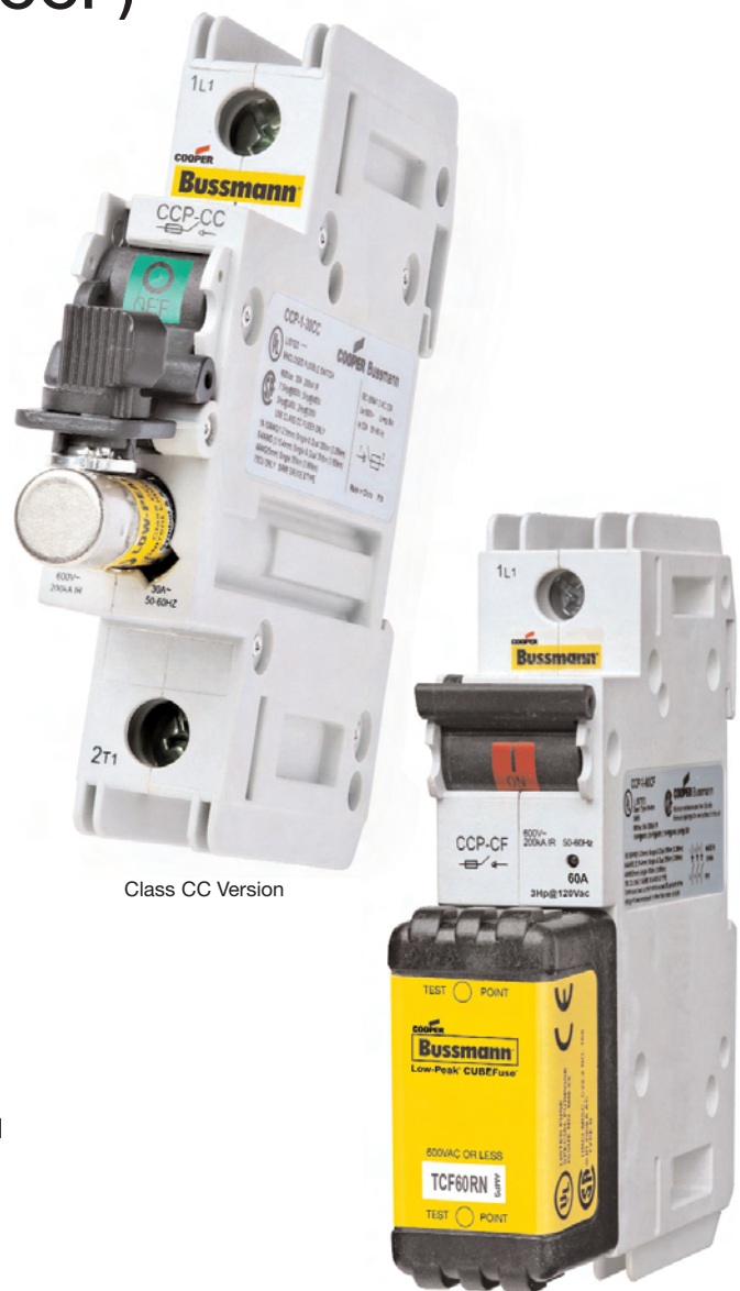
Class CC Version