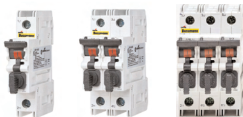
1-, 2-, and 3-pole Class CC and Midget CCP