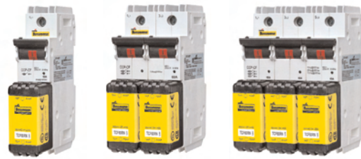
1-, 2-, and 3-pole 60A CUBEFuse CCP