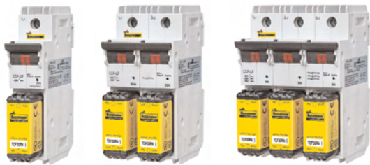
1-, 2-, and 3-pole 30A CUBEFuse CCP