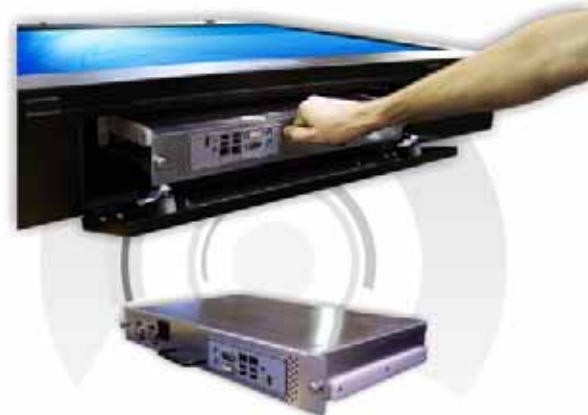
MODPAK - Full PC Engine