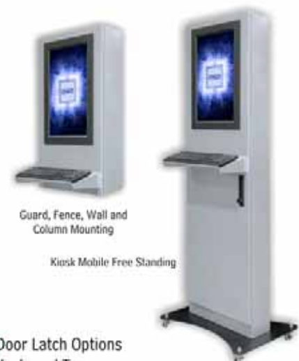
Guard, Fence, Wall and Column Mounting

It features a 22" Widescreen touchscreen monitor in portrait format and a PIX1 industrial computer with 1 PCI slot and a range of choices of internal configuration.