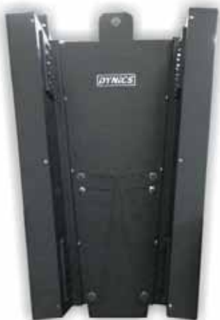
Back to Back Bracket