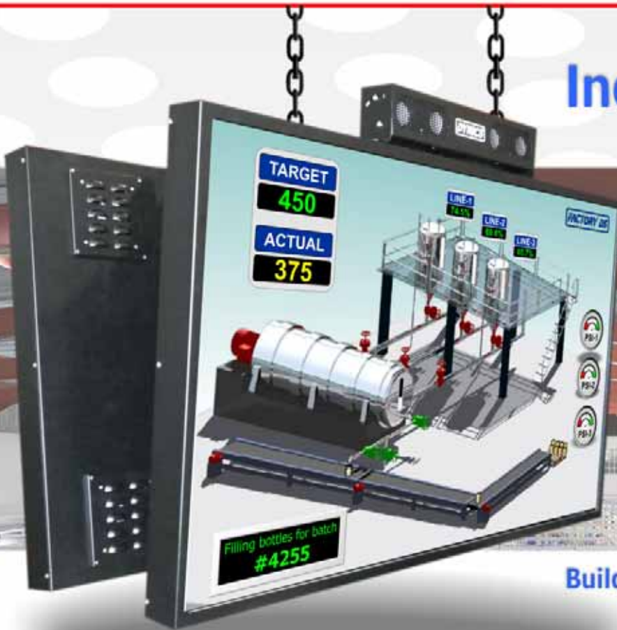
LX 55 LED Double Sided, Tilt Bracket with Soundbar

Build What You Want... ...Get What You Need