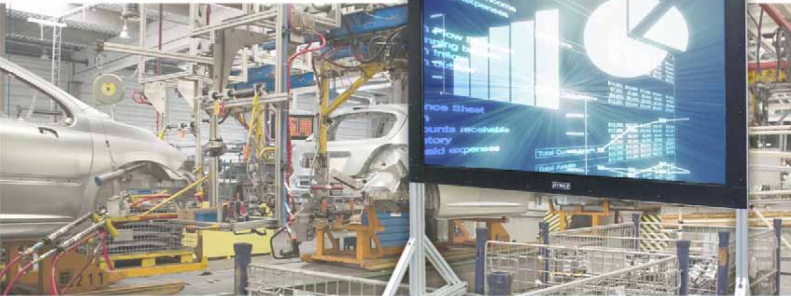
PWS70 with ModPak Player

The DYNICS Portable Workstation is our answer to an increasing need to bring closer interactive action to different locations and multiple audiences.