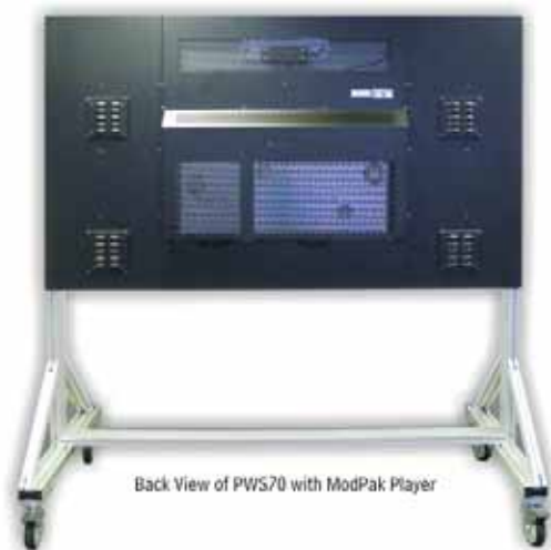
Back View of PWS70 with ModPak Player