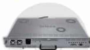
MODPAK - Standard Monitor Basic Feature Video Controller