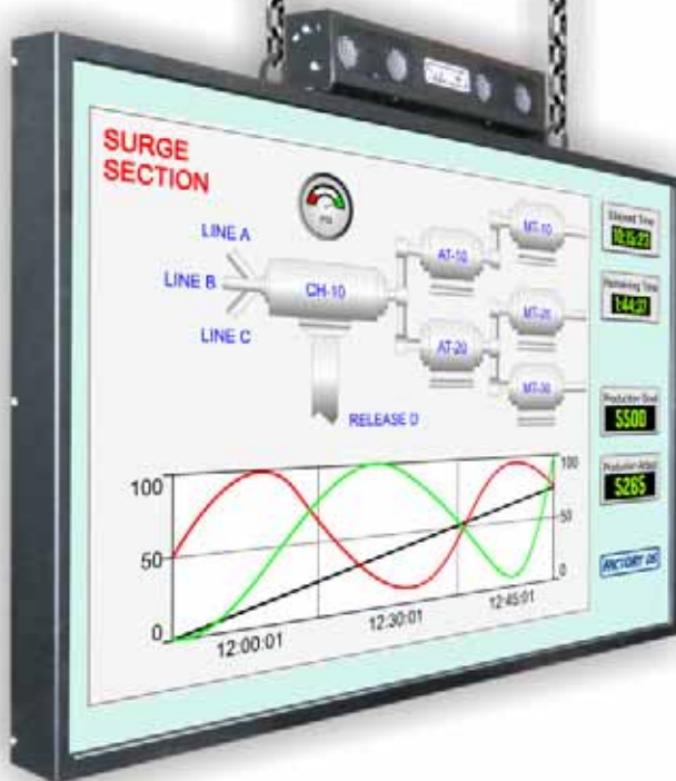
LX 55 With Soundbar & Embedded IPC