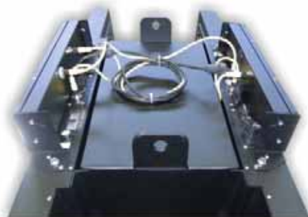
Easy connectivity of soundbars with double sided system