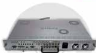
MODPAK - Pro AV Full Feature Controller RS/232