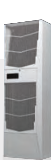
G52 Indoor/Outdoor 8000 & 12000 BTU/Hr. 2300 & 3500 Watts