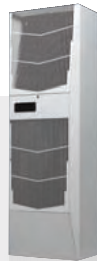
G57 Indoor/Outdoor 20000 BTU/Hr. 5900 Watts