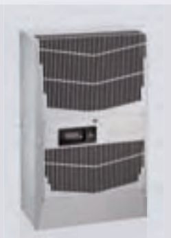
G28 Indoor/Outdoor 4000 & 6000 BTU/hr. 1172 & 1758 Watts