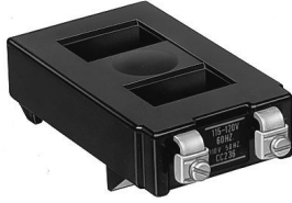
Used on Size 0...5