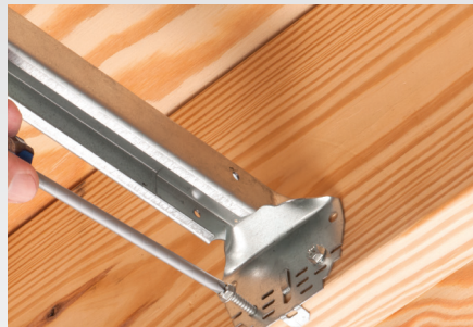
Bracket mounts securely to joists.