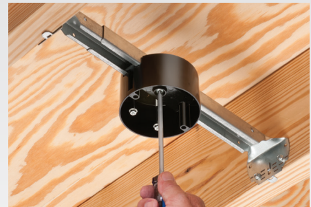
Loosen center screw to position box on bracket.