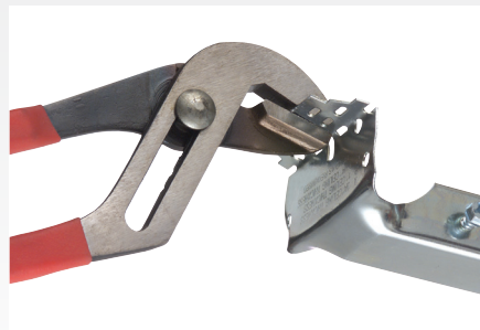
Bracket ends are pre-set for a 1/2" ceiling. For other ceiling depths, bend the bracket ends along the appropriate score line.