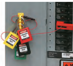
4. For group lockouts, run key through multiple loops in lock rail and apply locks. No hasps required! (Not recommended for use with multilock hasps)