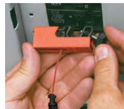
2. Attach the lockout device to the breaker and snap into locked position.