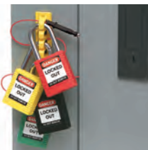
5. Low-profile lockouts allow panel doors to be closed on most breaker panels.