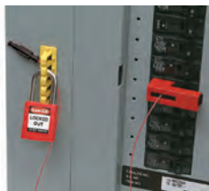
3. Pass plastic key through lock rail and attach lock, preventing key from sliding down cable and opening lockout device.