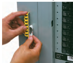
1. Expose the super-bond adhesive on back of rail. Permanently affix to any location on the panel.