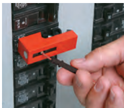
Lockout device is unlocked by inserting and turning the black plastic key.