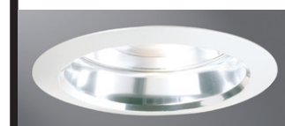
30CAT White Trim, Clear Specular Reflector