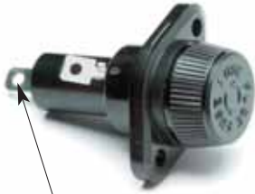
#10 wire max for solder connection