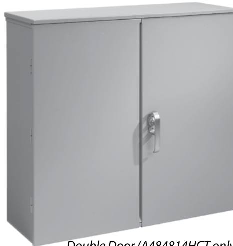
Double Door (A484814HCT only)