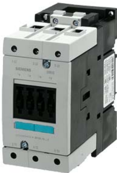
CONTACTOR, AC-3 30 KW/400 V, AC 220V 50HZ/240V 60HZ 3-POLE, SIZE S3, SCREW CONNECTION