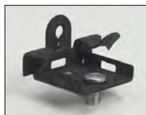
1/4" -20 x 3/8" Staked Stud